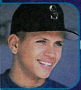
the hard-knock life of Alex Rodriguez

THE NEWS MAGAZINE THAT RAISES VOICES APRIL 19 - 25, 1999