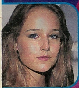
Leelee Sobieski is one smart starlet